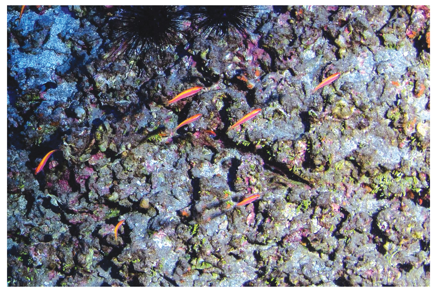
Figure 4. Luzonichthys kiomeamea in its natural habitat, 83 m, Hanga Piko, Rapa Nui (Easter Island), Chile (L.A. Rocha).

life (Table 1; Randall & McCosker 1992, Copus et al. 2015). Also of note is that our specimen has three opercular spines, while other Luzonichthys species generally have two (Randall & McCosker 1992).