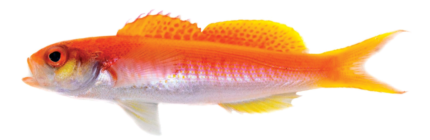
Figure 1. Luzonichthys kiomeamea, sp. n., holotype, CAS 244640, 45.7 mm SL, shortly after death (L.A. Rocha).

Description. (counts and measurements of holotype in Tables 1 & 2) Dorsal-fin elements X,16; anal-fin elements III,7; pectoral-fin rays 22, dorsalmost unbranched, others branched; pelvic-fin rays I,5; caudal-fin principal rays 8+7 (7+6 branched), procurrent rays 12 dorsal, 12 ventral; gill rakers 12+26; vertebrae 26 (11 precaudal + 15 caudal), pleural ribs on vertebrae 3 through 11; no supraneurals in preneural and first interneural space, one pterygiophore bearing two supernumerary spines in second interneural space; dorsal ray-pterygiophore-neural-spine digitization pattern \frac{1}{2} (Fig. 2).