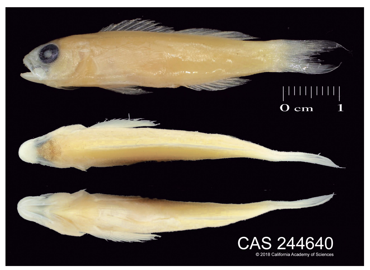
Figure 3. Luzonichthys kiomeamea, sp. n., preserved holotype, CAS 244640, lateral, dorsal, and ventral views.

Comparisons. The new species is the eighth species of the genus. As with the other 7 recognized species in the genus, L. kiomeamea is a small (~5 cm in TL), slender-bodied fish that possesses 11+15 vertebrae and a dorsal fin deeply notched between the spinous and soft portions. It can be distinguished from congeners by the number of pectoral-fin rays, anal-fin rays, lateral-line scales, the number and arrangement of gill rakers, and the color in