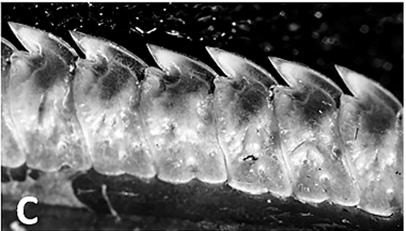
Figure 3. Etmopterus benchleyi , n. sp., adult female paratype (USNM 423209): A) Upper and lower in situ dentition of specimen before preservation; B) upper right functional tooth row showing the labial face; C) lower right functional tooth row showing labial face of lateral teeth (left), mesial to anterolateral teeth (right).