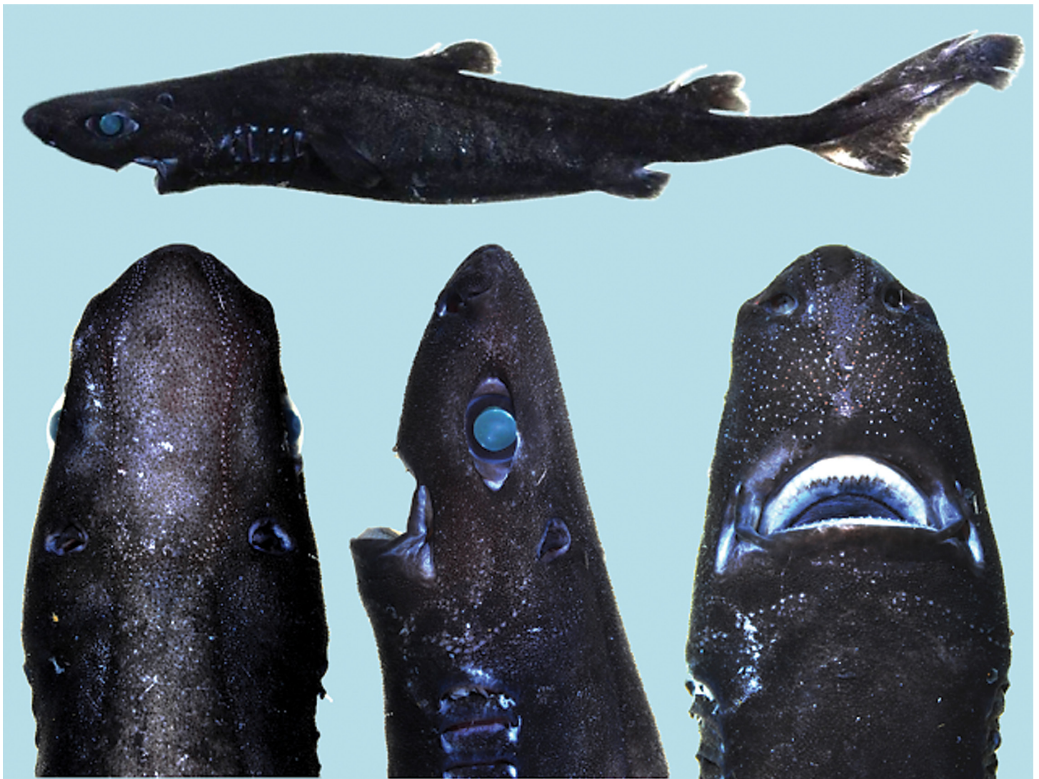
Figure 2. Etmopterus benchleyi , n. sp., paratype, USNM 421539, immature male, 292 mm TL, fresh specimen.

Body fusiform, trunk sub-cylindrical, width 0.8 (0.8–1.5) in trunk height; body narrows posteriorly with trunk width 0.8 (0.7–0.9) times into head width, tail width 0.4 (0.4–0.5) times into abdomen width. Head not depressed,