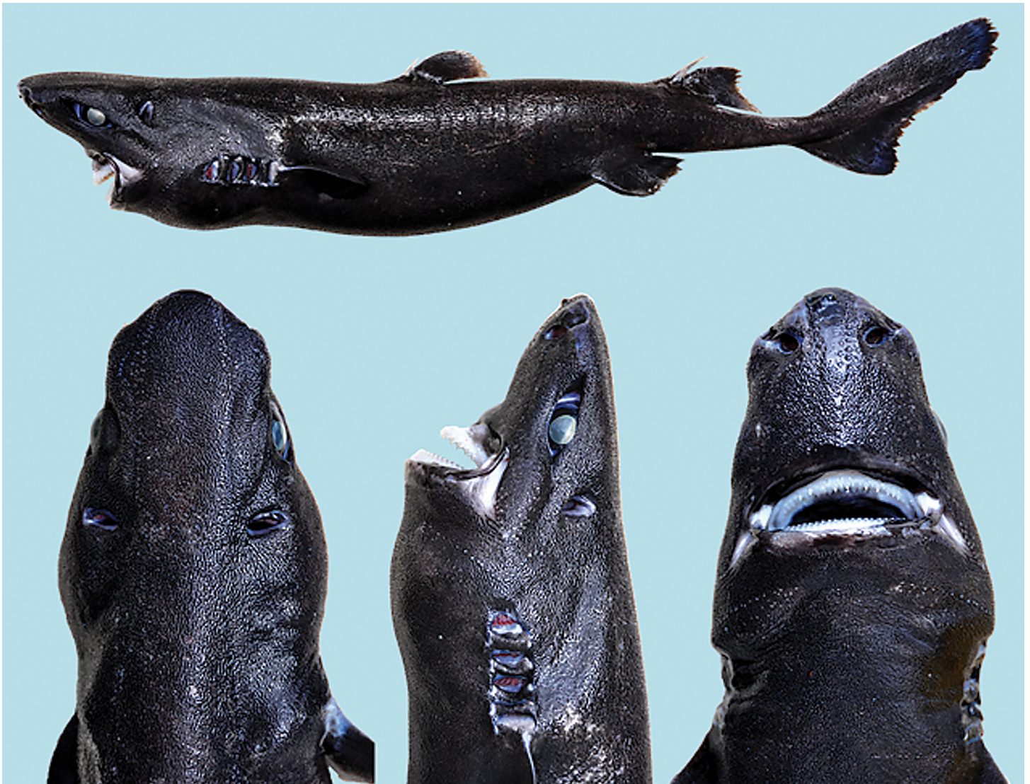
Figure 1. Etmopterus benchleyi , n. sp., holotype, USNM 423195, adult female, 458 mm TL, fresh specimen.

Paratypes. (from bottom trawls by D.R. Robertson aboard the R/V Miguel Oliver ) USNM 423209, 515 mm TL, adult female, Costa Rica, 9°01'10" N, 84°34'54" W, collected at 1359–1443 m, Nov. 24, 2010; USNM 422645, 325 mm TL, immature male, Central America; USNM 422639, 290 mm TL, immature male, Panama, 7°04'52" N; 81°22'55" W, collected at 1113–1126 m, Nov. 18–19, 2010; USNM 421539, 292 mm TL, immature