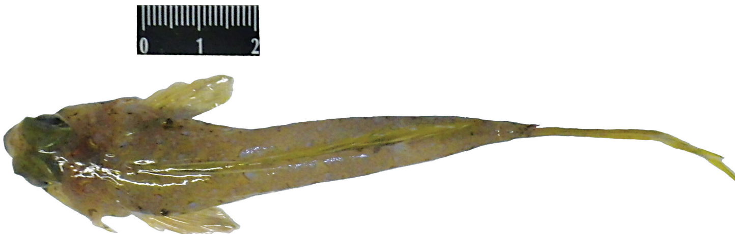
Figure 2. Callionymus petersi, n. sp., MNHN 2016-0004, paratype, male, 89.5 mm SL, Papua New Guinea, New Ireland Province, 8.5 km westnorthwest of Kavieng. Photograph taken immediately after collection (scale indicates 20 mm).

Diagnosis. A species of the subgenus Callionymus ( Bathycallionymus ) with a short head (3.9–4.3 in SL); eye large (2.1–2.3 in head length); preopercular spine with a long, slightly upcurved main tip, a small antrorse serra followed by two large curved points on its dorsal margin and a strong antrorse spine at its base, ventral margin smooth, slightly concave; first dorsal fin higher than second dorsal fin in the male, slightly lower than second dorsal fin (female), with 4 spines, first spine filamentous (male only); second dorsal-fin high, distally convex (male) or low, distally nearly straight (female), with 9 unbranched rays (last divided at base); anal fin with 9 unbranched rays (last divided at base); 18 pectoral-fin rays; caudal fin elongate (male), the two median rays unbranched, elongate but barely filamentous (male), or distally rounded, without filaments (female); pectoral-fin