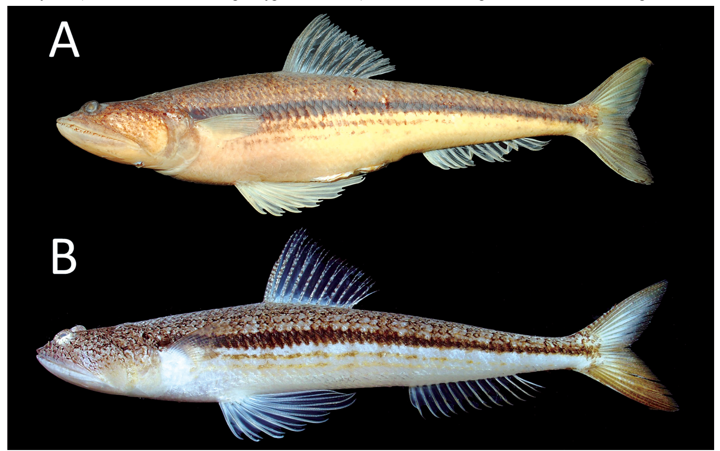
Figure 1. Synodus nigrotaeniatus , A) preserved holotype (LBRC F-3773), 233.5 mm SL, Lembeh Strait, Indonesia; B) fresh paratype, 152.0 mm SL, Lembeh Strait, Indonesia (T. Peristiwady).

Description. Dorsal-fin rays 12 (11 in one paratype), branched except first two, last branched to base; anal-fin rays 14 (12 & 13 in each of two paratypes, 14 in one), unbranched except last, branched to base; pectoral-fin