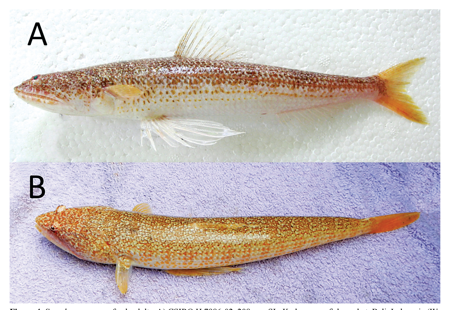
Figure 4. Synodus sageneus , fresh adults: A) CSIRO H 7986-02, 208 mm SL, Kedonganan fish market, Bali, Indonesia (W. White); B) approx. 190 mm SL, Gintota (just north of Galle), SW Sri Lanka, depth about 20 m (Ton Nientied).

Comparisons. The new species is very similar to Synodus sageneus Waite, 1905 (Fig. 4), which is widely distributed around the northern coast of Australia with extra-limital records from Sri Lanka and Indonesia (Bali and West Papua). These two species differ markedly from congeners in having a relatively robust body with the eyes directed more dorsally, a more gradually angled snout profile, an anal-fin base that is longer than the dorsal-fin base, more anal-fin rays (12–15 vs. 8–11), a tiny and inconspicuous adipose fin, and a prominent suborbital pore with surrounding fimbriae.