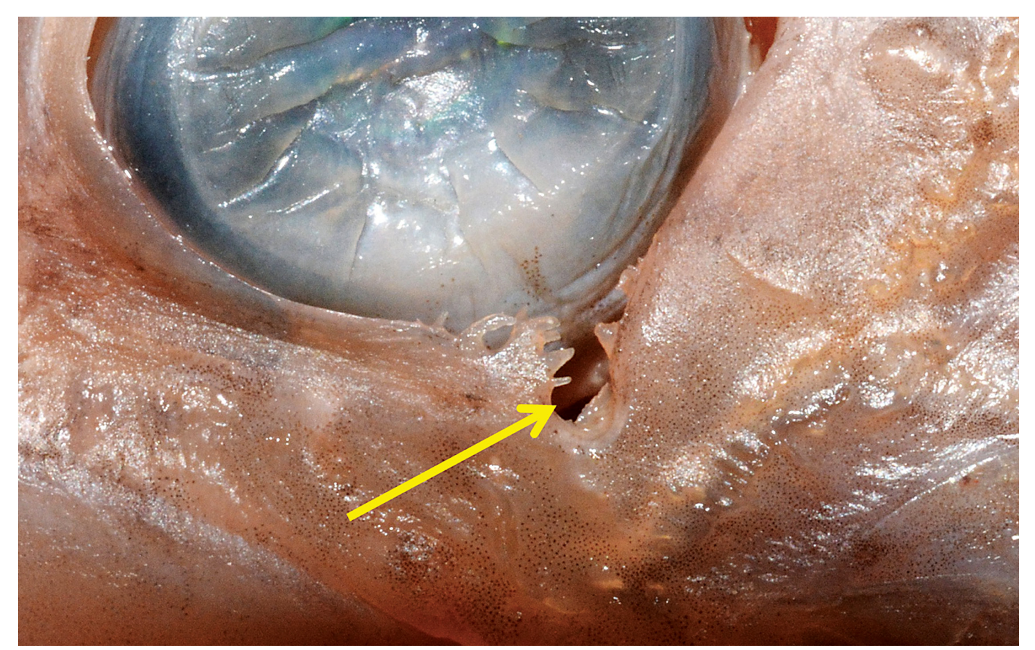
Figure 5. Synodus sageneus , WAM P.4785-001, 247.0 mm SL, Shark Bay, Western Australia, suborbital pore (arrow) and associated fimbriae, image reversed.

Remarks. The deep pore or pit below the posterior portion of the eye is a key feature of the new species and S. sageneus . Examination of various Synodus species at WAM revealed that a small slit or indentation is always present, but never forms a deep pore and is lacking the elaborate fimbriation of the adjacent adipose eyelid. It seems strange that the indentation, although common among synodontids, has not been previously mentioned in specialized taxonomic literature dealing with this family. Generally, for most synodontids there is typically a shallow indentation that is internally blocked by a continuation of the adipose membrane, rather than forming a deep pore as in the new species and S. sageneus (Fig.5).