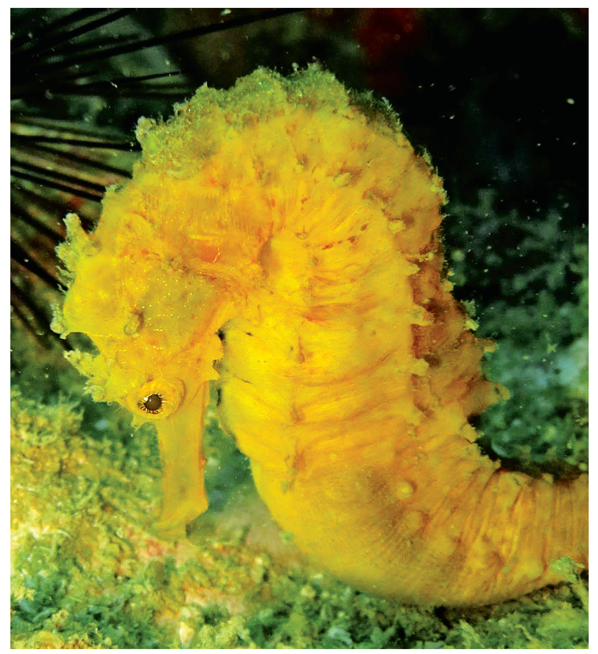
Figure 4. Hippocampus tristis , underwater photograph at 2 m depth at St Leonards Pier, Victoria, Australia; about 12 cm high.

Coronet: small and leaning back with diverging short spines on apex, posterior ones enlarged.